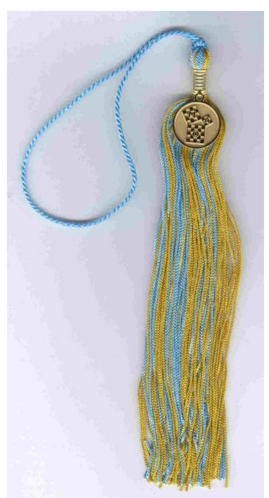
Mu Alpha Theta Tassels are now available for a $5 donation to the Educational Foundation. These can be used on your Graduation Cap, where allowed, or as a decoration in your car, your room, or on your person.