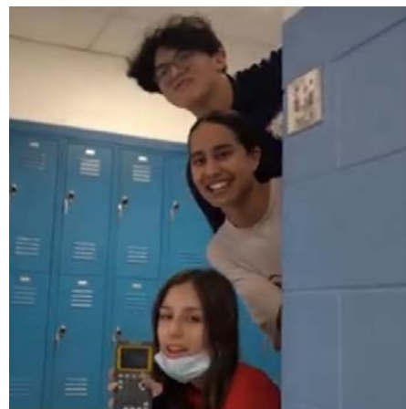
More on page 2

HUNEKE AWARD NOMINATION DEADLINE IS JUNE 15TH. NOMINATE YOUR FAVORITE SPONSOR!